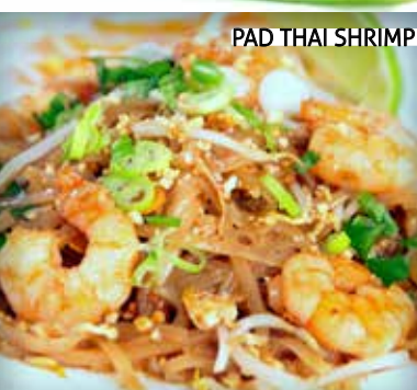
PAD THAI SHRIMP

Orange Chicken Crispy chunks of chicken breast tossed in a flavorful sauce with mandarin oranges and a hint of chili. 18