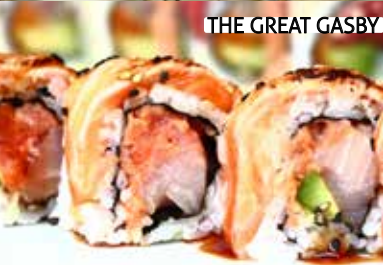
THE GREAT GASBY