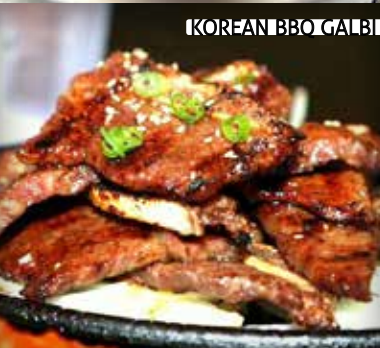
KOREAN BBQ GALBI

Korean BBQ Galbi Beef short ribs with bones, marinated in a traditional Korean recipe, and seared to perfection! 28