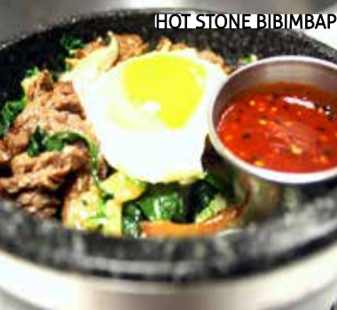
HOT STONE BIBIMBAP