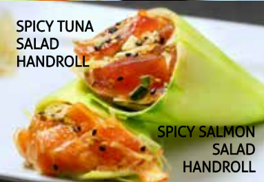
SPICY SALMON SALAD HANDROLL