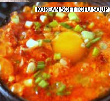
KOREAN SOFT TOFU SOUP