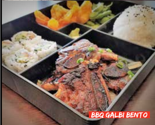
BBQ GALBI BENTO