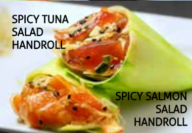
SPICY SALMON SALAD HANDROLL