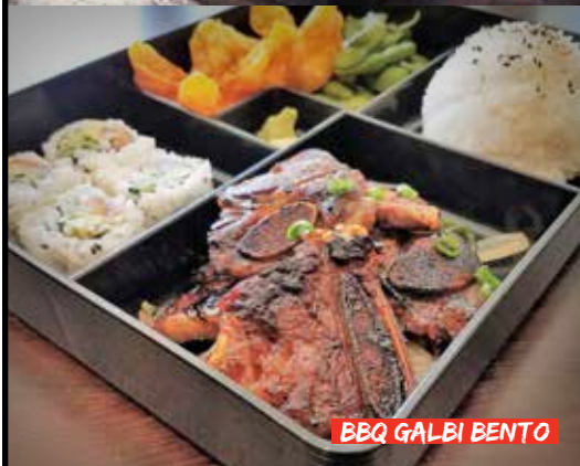
BBQ GALBI BENTO